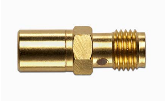
Model 72979 SMA (F) TO SMB (F)